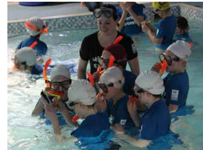
Undersea Explorers in action

Gained funding for, and ran the first Undersea Explorers events where children experience the value of marine life through snorkelling in the safety of a pool.