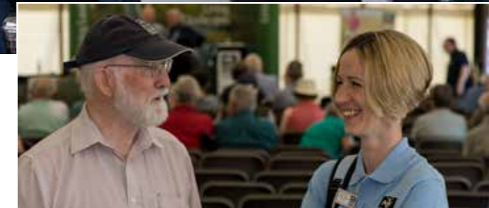
Volunteer and staff at AGM 2014

Gratefully received the help of over 80 Volunteer Wardens who worked alongside the reserve staff to look after the nature reserves and nature parks.