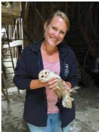
Barn Owl Project

Made preparations to vaccinate badgers on Trust land against Bovine Tuberculosis, even though the Trust was later prevented from doing so.