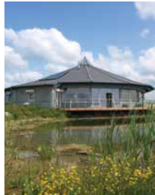
Abberton Reservoir Visitor Centre

Embedded the new accounts system called IRIS to provide improved security and management of all financial matters.