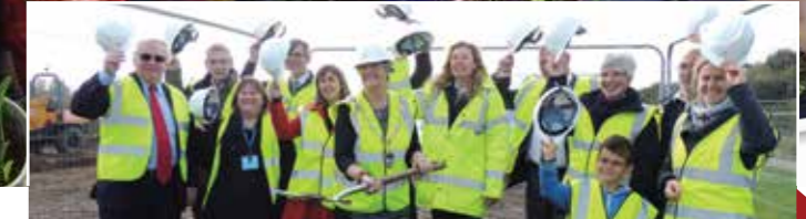
Starting work on the Ingrebourne Visitor Centre

The new Essex website was launched on the Wildlife Trusts national platform which is supported by over 40 Wildlife Trusts.