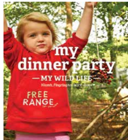
My Wild Life campaign

Formed part of the national Nature and Wellbeing Group which developed the ideas for My Wild Life campaign and for the proposed Nature and Wellbeing Act.