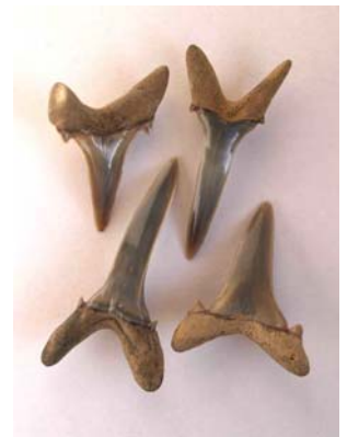
Sharks' teeth from the London Clay.

The clay exposed at Walton is at the base of the London Clay sequence (Division A). During the Eocene period the European continental plate was just starting to split away from North America and this was accompanied by intense volcanic activity in western Scotland. Evidence of this is present here as pale bands in the London Clay cliffs which contain volcanic ash from these eruptions.