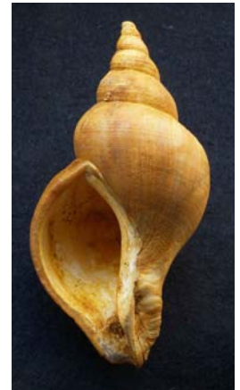
Neptunia contraria from the Red Crag.

The junction between the London Clay and the Red Crag represents a time interval of about 47 million years. At this junction there is a thin, impersistent layer of phosphatic nodules, fossils derived from the London Clay and well rounded lumps of sandstone called 'boxstones' believed to be of Miocene age (about 10 million years old). Boxstones are the only examples of Miocene rocks in Britain. The Nodule Bed also yields very rolled but highly polished bones of whale and large terrestrial mammals such as deer and elephant. These were washed into the Red Crag Sea from Miocene deposits removed by marine erosion long ago, and possibly recycled several times before being incorporated in the Red Crag. The high polish shown by the fossil bones from the Red Crag is still a mystery. Shark teeth can also be found in the nodule bed, most of them derived from the London Clay but some are from Miocene and Red Crag sharks.