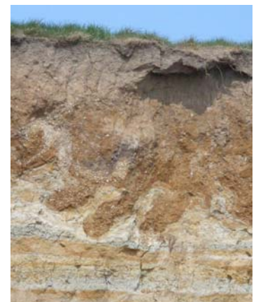
Contorted sediments at the top of the cliff.