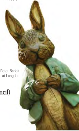
Peter Rabbit at Langdon