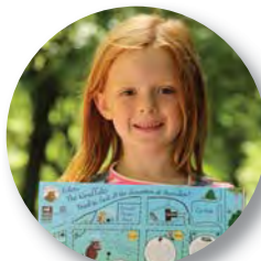
Following the Gruffalo trail