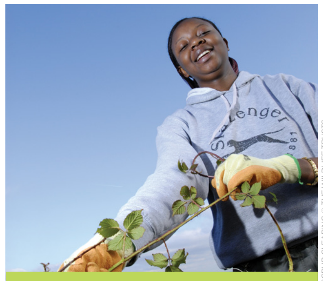
SCRUB CLEARING

A natural, community-based approach to health offers an important non-medical service that will deliver health prevention at scale and reduce the current burden on the NHS.