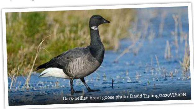
Dark-bellied brent goose

Wrap up warm, put your wellies on and spot golden plover, dunlin and teal whilst listening out for the noisy flocks of up to 2,000 wintering dark-bellied brent geese! With over 87 nature reserves, we have plenty of walks to keep you exploring!