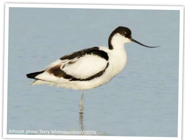
Advocet

"The truth is, the natural world is changing. It is the most precious thing we have and we need to defend it" . Sir David Attenborough