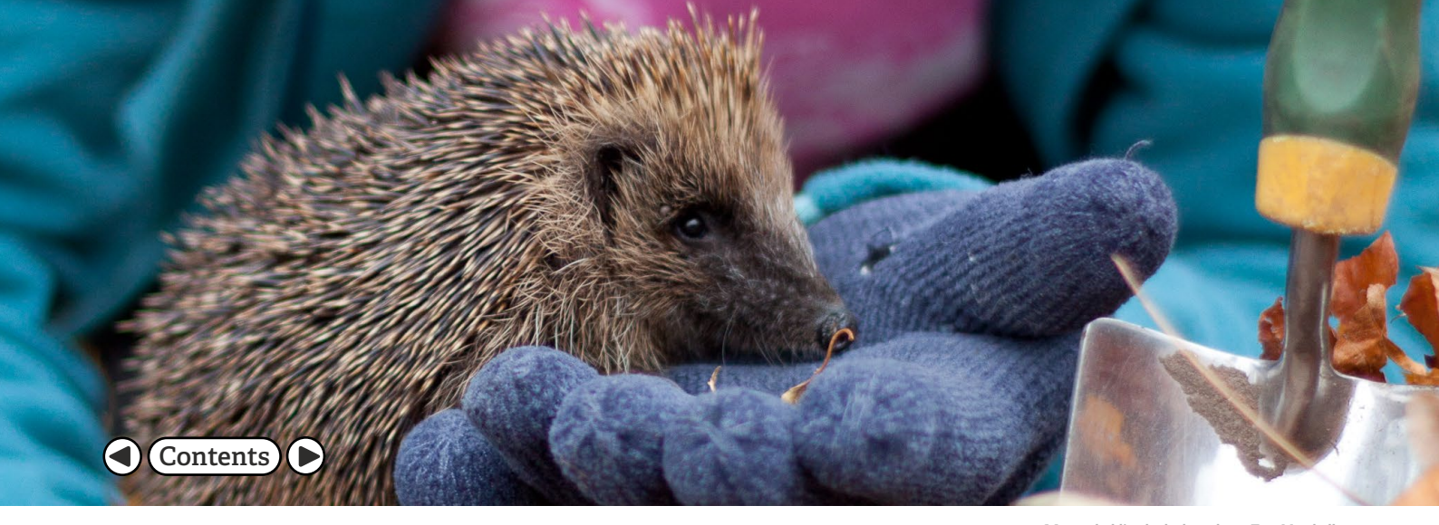
Woman holding hedgehog