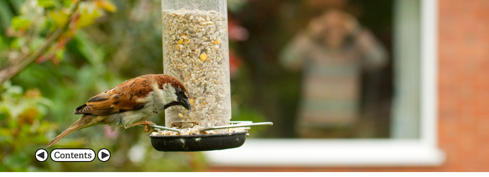
House sparrow