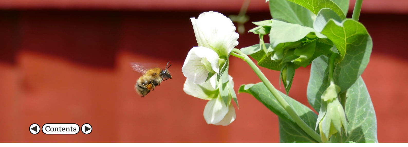
Carder bee approaching peas