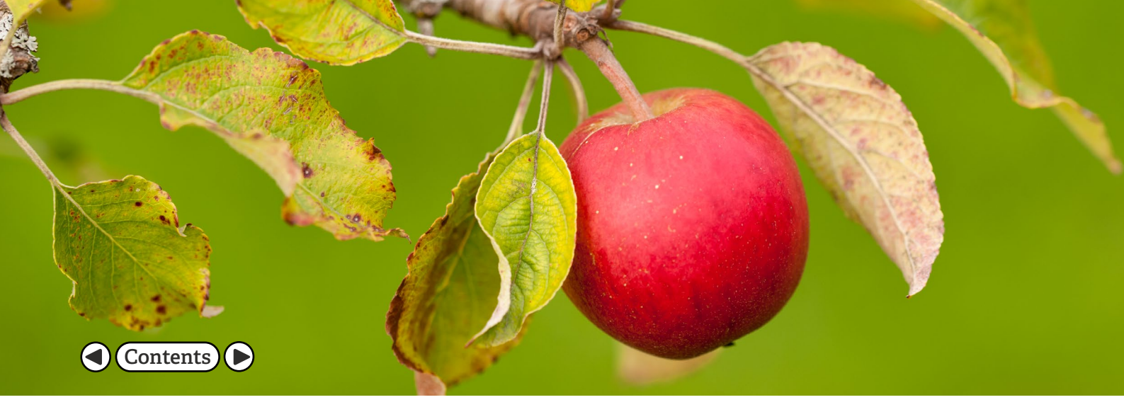
Apple growing in traditional orchard